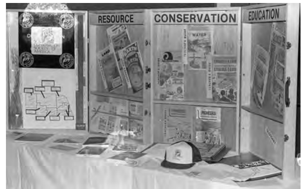
SCSA Table Display

Reminder: If you see or hear of news about Nebraska Chapter Members, please send a photo, web link, or newspaper scan to Craig for inclusion in the Chapter archives.