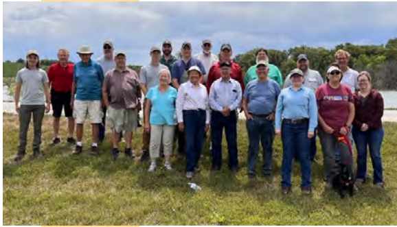
SWCS Group during Buck and Duck Creek Lake Tour

The 2023 Nebraska State SWCS Meeting was held June 28-30, 2023 at the Lied Lodge and Conference Center in Nebraska City.