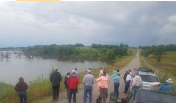
Buck Creek Reservoir Tour

The annual meeting included technical presentations and tour of Arbor Day Farm highlighting its agronomic pursuits and management, a tour of the Buck & Duck Watershed Project, SWCS Awards Banquet and Council Meeting.