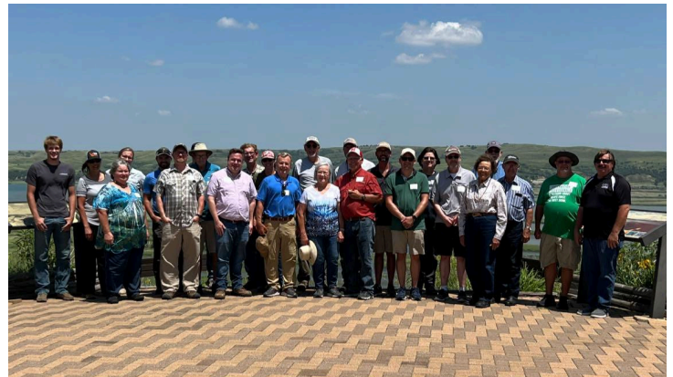
Nebraska SWCS 2022 Annual Meeting attendees pose for a group photo at Niobrara State Park.

The annual meeting wrapped up with the awards banquet, silent auction and business meetings. The minutes of the annual Foundation business meeting and the annual Chapter business meeting can be found online at http://nebraskaswcs.org/past-events---information.html .