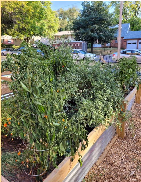
Lincoln Northeast provided produce from the garden beds to the public during the “We are Lincoln Northeast” event held September 29, 2022.