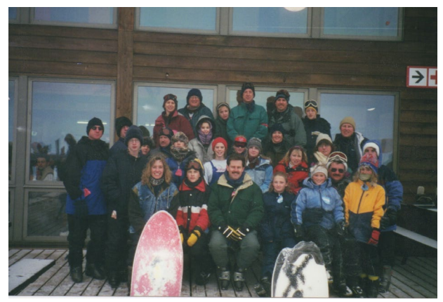
2000 Nebraska SWCS chapter ski trip group.

WHAT: Some of the original ski club members invite