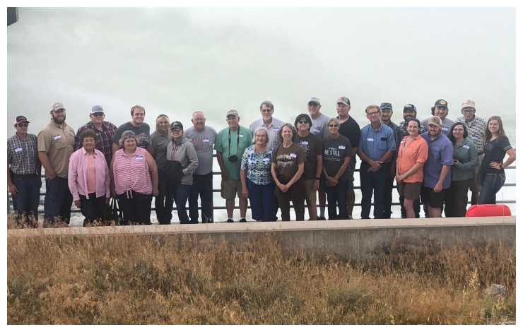
Tour group standing in front of the overflow from the hydroelectric plant at Kingsley Dam, Lake McConaughey June 24, 2021.

Minutes of both the 2021 Foundation Business Meeting and the 2021 Nebraska SWCS Chapter Business meeting have been posted on the "past events" page at https://nebraskaswcs.org.