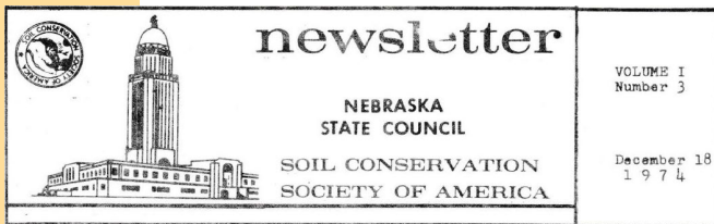
1974 Nebraska Council SCSA newsletter header.