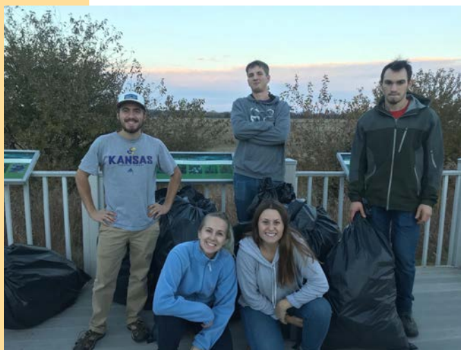
UNL Soil and Water Resources Club members completed two wetland cleanup projects.