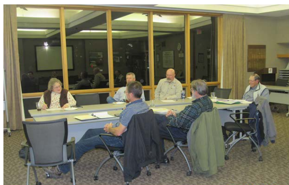
A portion of the scholarship review committee discussing the final applicant rankings to determine scholarship recipients.