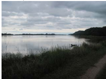
SWCS annual meeting participants enjoyed the beautiful Missouri River while in Ponca State Park.