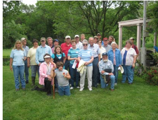
A group picture of the 2010 Nebraska SWCS annual meeting participants.