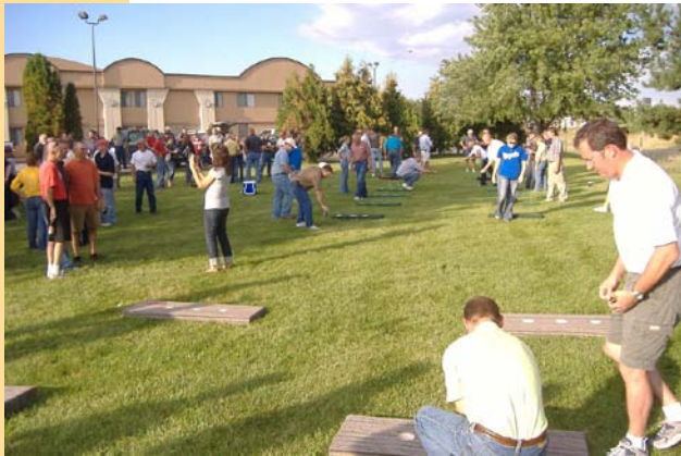
33 teams took part in the Horse Chip tournament held at the Nebraska NRCS All Employees Meeting in Kearney September 1, 2010.