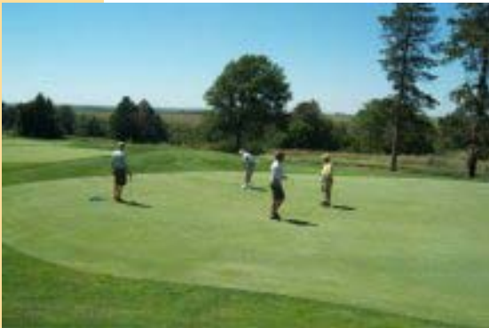
Great weather for the event!