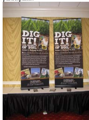
"DigIT" display at the International SWCS meeting.