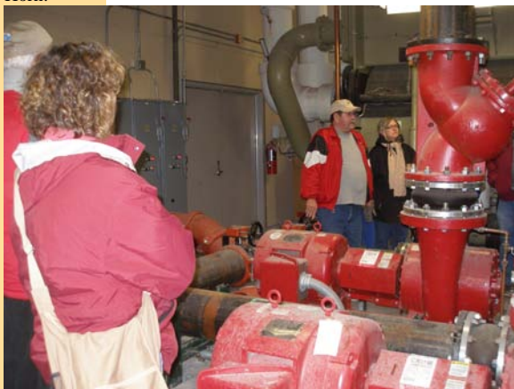
SWCS members on a tour of Chadron State College’s boiler system which uses wood chips, water, and steam to heat and cool the campus.