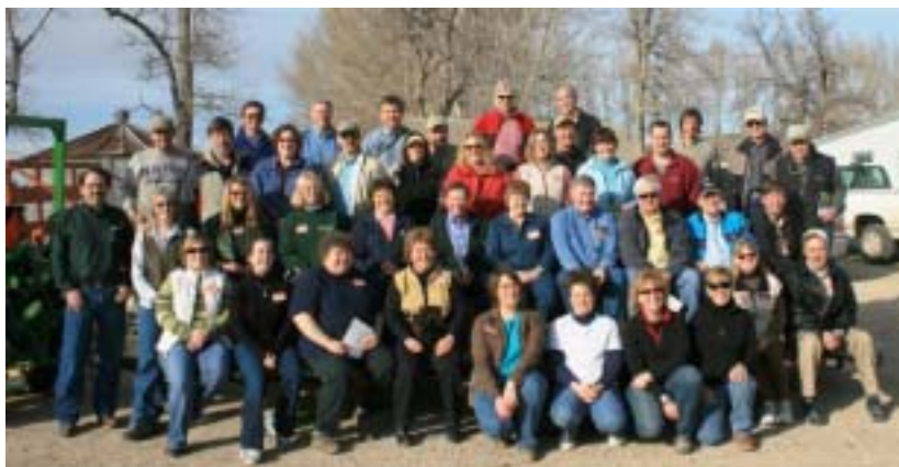
Attendees at the Northern Plains Regional Meeting pause for a group photo.