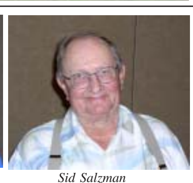
SWCS NEWS - Page